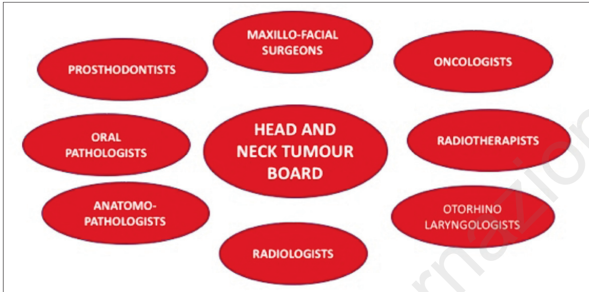
Figure 2. Head and Neck Tumour Board organization.

(scalpel and laser biopsy), pharmacological therapies, maxillofacial surgery and prosthetic rehabilitations.