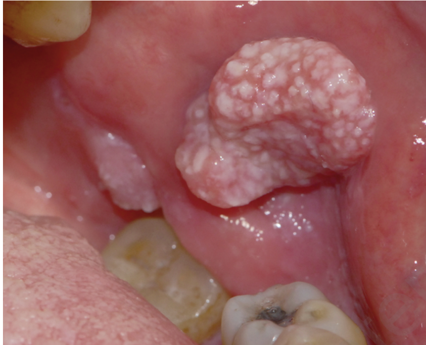
Figure 4. Intraoral aspect of verrucous carcinoma of the buccal mucosa.

improved in individuals who had a family history of OC compared to individuals with no family history (11). Furthermore, the Authors noticed that the patients' knowledge did not appear to be provided by clinicians, as less than 15% of participants reported