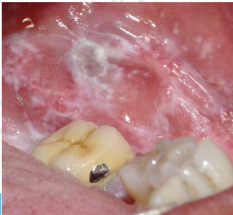
Figure 5. Intraoral aspect of lichen planus of the buccal mucosa.

Colella G et al. (9) performed an epidemiological in-